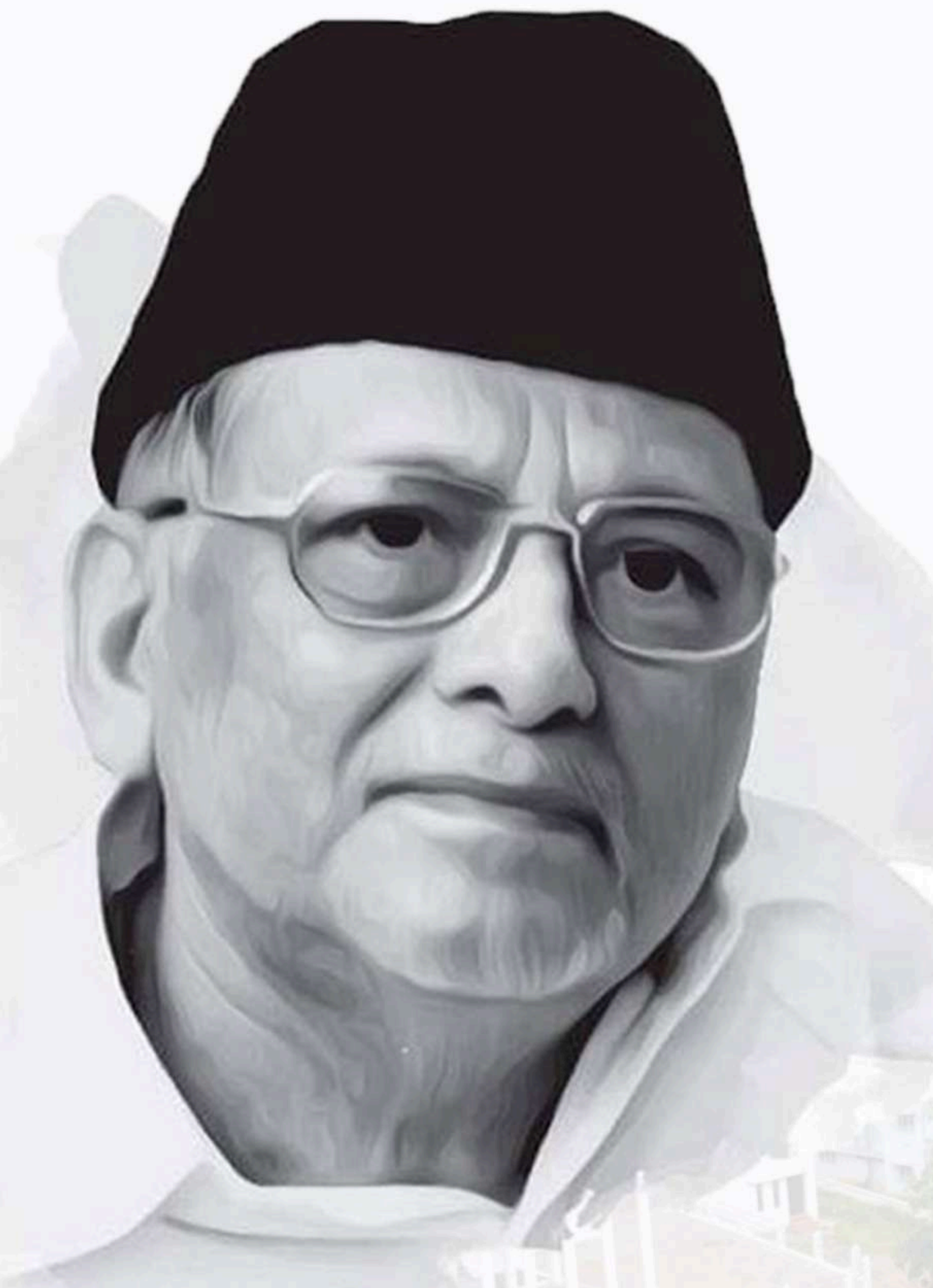
SAYYID MOHAMMED ALI SHIHAB THANGAL PANAKKAD